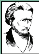
Blessed Frederick Ozanam Our Founder

Inspired by Gospel Values, the Society of Saint Vincent de Paul, a Catholic lay organization, leads women and men to join together to grow spiritually by offering person-to-person service to the needy and suffering in the tradition of its founder, Blessed Frederic Ozanam , and patron, Saint Vincent de Paul .